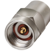
CASE STYLE: LL2699-1