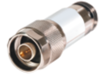
CASE STYLE: FF779