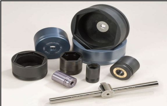
DMC1358 COMPOSITE JAM NUT TOOL KIT

The correct application of torque is essential to most connector applications where Jam Nut receptacle connectors are used. The sealing components (usually an "O" ring) must be compressed, but not to the point of damage. Another important consideration when tightening Jam Nuts is the thread strength, especially in the various types of aluminum and composite connectors.