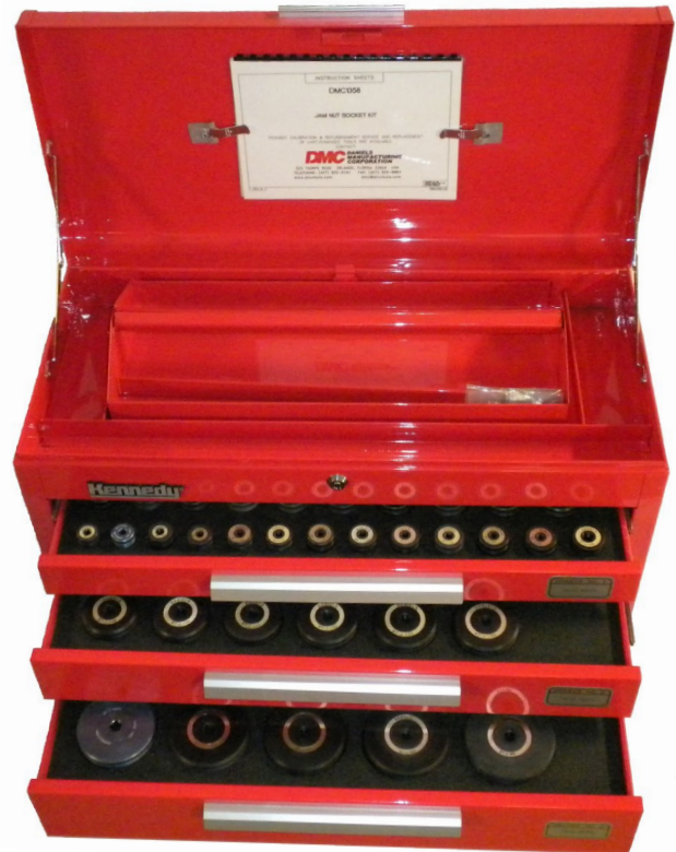
Actual Kit may vary from example shown.