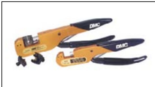
DMC169A (M83521/7-01) HX4 AND ACCESSORIES TOOL KIT

The DMC169A Tool Kit contains the HX4 (M22520/5-01) associated Die Sets for MIL-Spec shielding ferrules (MS21980/MS21981) and MIL-Spec coaxial contacts (MS39029/6/13/14, M39029/7/8, M83733/13/14 and ON089558). The kit is supplied in a metal case with foam inserts, contoured tool cavities, laminated instruction sheets permanently attached on a ring binder, and contents charts identifying the location of each tool.