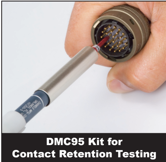
DMC95 Kit for Contact Retention Testing

The quality assurance test most often overlooked is contact retention (the proper seating of contacts within the connector). This important test can now be performed simply and in a matter of seconds with the DMC95 Retention Test Tool Kit .