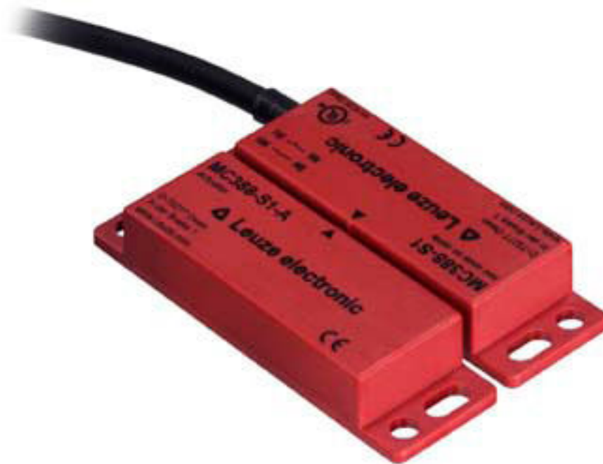
Figure can vary