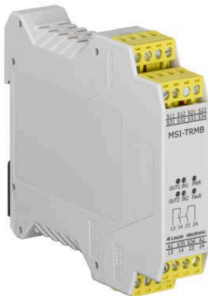
Part no.: 547931 MSI-TRMB-01 Safety relay