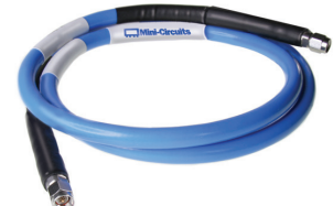
CASE STYLE: MB1629-2