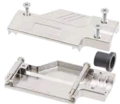
Compression Insert Sizes: (inner diameter)