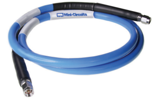
CASE STYLE: MB1629-1.5