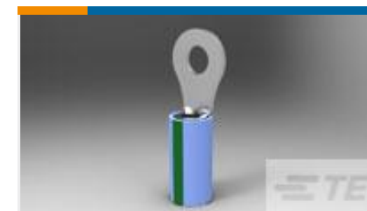
TE Part #2-320561-4 TERMINAL,PIDG R IR 14 6