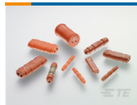
TE Part #CTL-20-513 JUNCTION ASSY