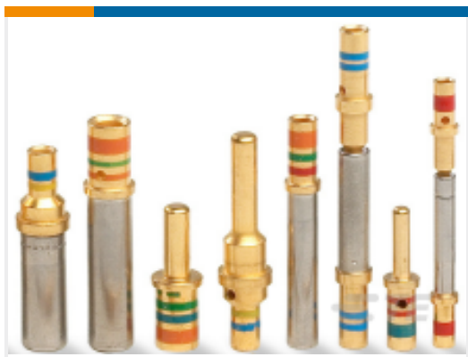
TE Part #0007-008-100L CONT SOC ASSY