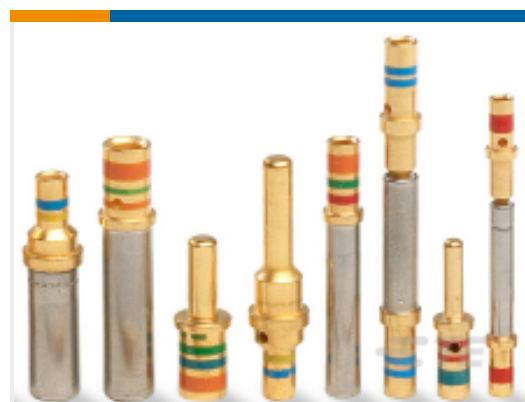
TE Part # 0007-008-100L CONT SOC ASSY