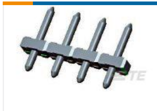
TE Part #1-282832-3 TERMI-BLOK PIN HEADER 5MM STAC