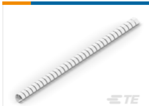
TE Part #142840-2 TUBING SPIRAP 500030-2