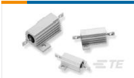
TE Part #1879071-9 THS50 R50 5%