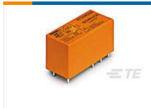
TE Part #5-1393238-7 RTD14F03