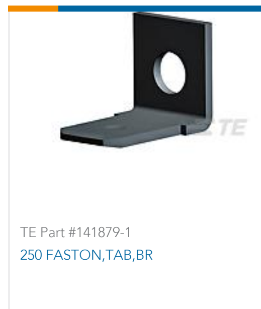
TE Part #141879-1 250 FASTON,TAB,BR