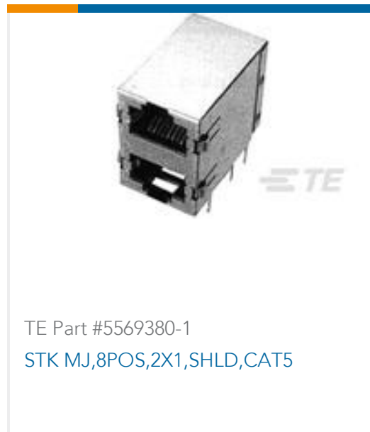
TE Part #5569380-1 STK MJ,8POS,2X1,SHLD,CAT5