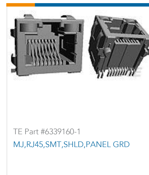
TE Part #6339160-1 MJ,RJ45,SMT,SHLD,PANEL GRD