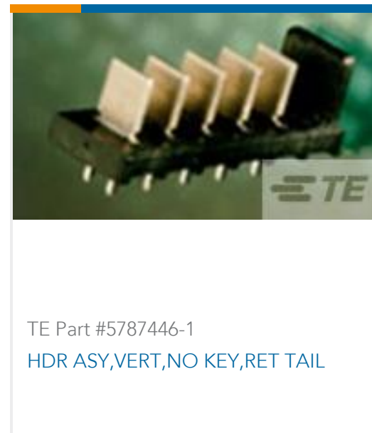
TE Part #5787446-1 HDR ASY,VERT,NO KEY,RET TAIL