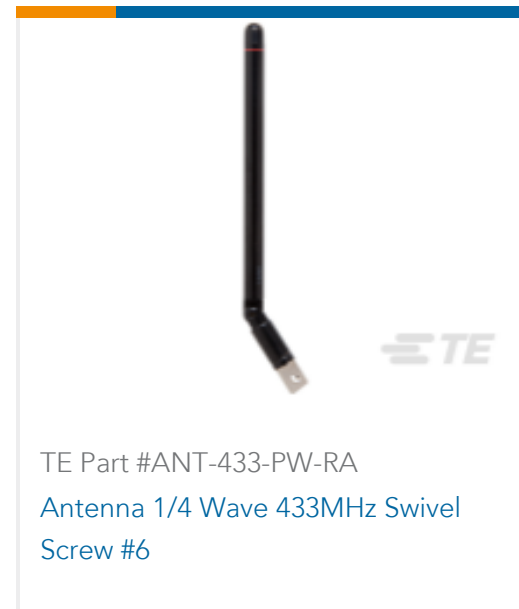
TE Part #ANT-433-PW-RA Antenna 1/4 Wave 433MHz Swivel Screw #6