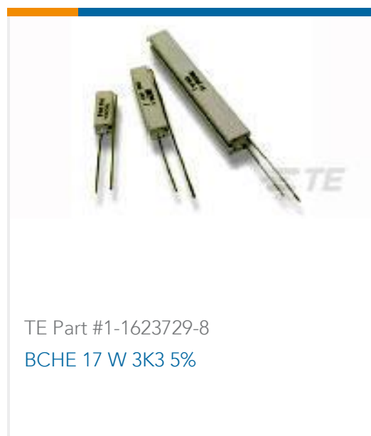
TE Part #1-1623729-8 BCHE 17 W 3K3 5%