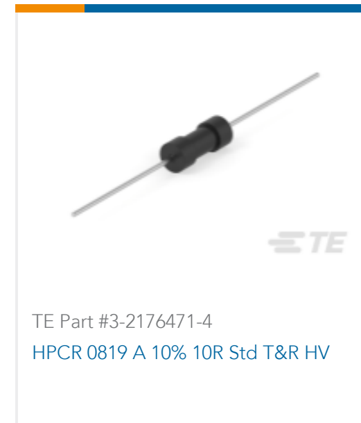
TE Part #3-2176471-4 HPCR 0819 A 10% 10R Std T&R HV Screw #6