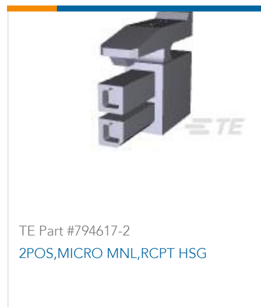
TE Part #794617-2 2POS,MICRO MNL,RCPT HSG