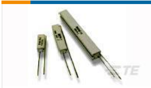
TE Part #1623732-1 BCHE 7 W 100R 5%