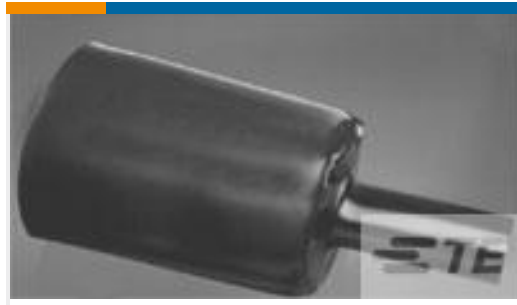
TE Part #CX7207-000 RHW-90/25-1200/ADH-0