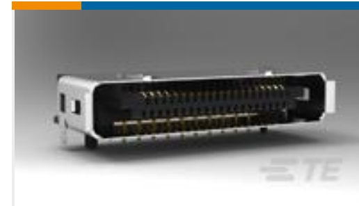
TE Part # 2129260-2 REC ASSY 0.6mm CHAMP DOCKING C