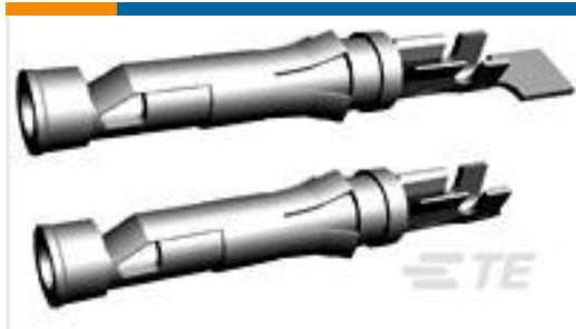
TE Part # 66109-3 III+ SKT, 26-24, 15AU/FL, LP