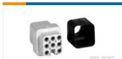
TE Part # 2-1103101-3 HN.D.7.BU.C. 250 V