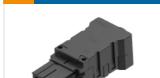
TE Part # 1971239-1 D5200 REC CABLE CLAMP 4P(2ROW) KIT X-X