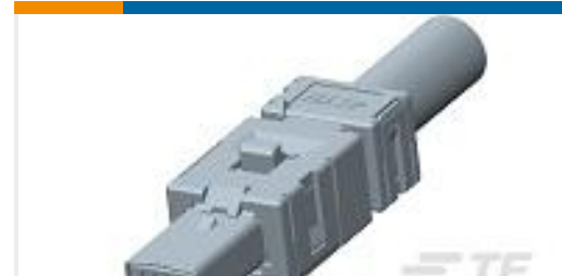
TE Part # 2201855-3 MINI I/O PLUG KIT TYPE I LM MIX