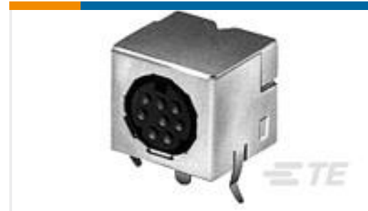
TE Part # 5749232-1 Mini DIN, 8 pos, R/A, Shield