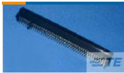
TE Part #8-1734774-4 PCI EXP 2.3L 98 POS BLK G/F