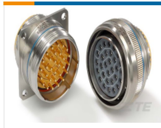
TE Part #ZPF0000000000036945 983-6SE 14-04 SN-L