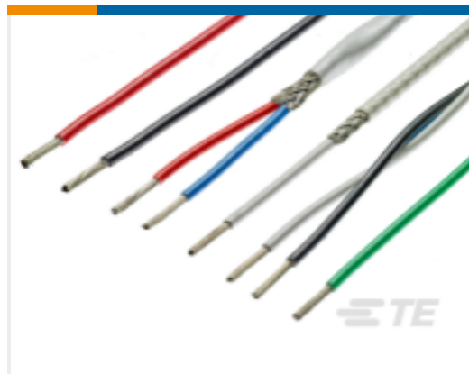
TE Part #3643333001 100G0121-0.60-9/9