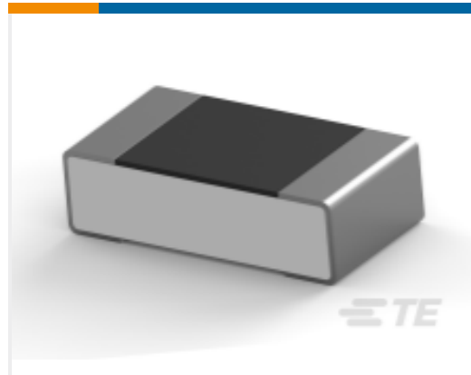
TE Part #2-2176370-1 RQ 0603 698R 0.1% 10PPM 5K RL