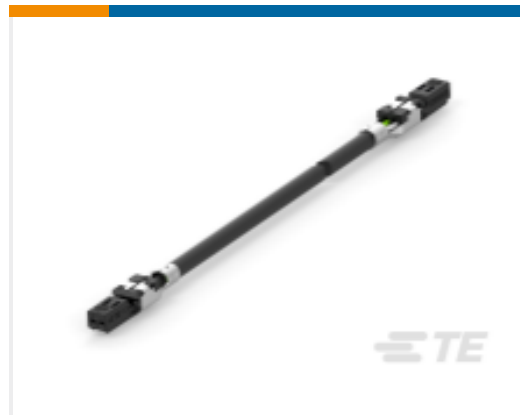
TE Part #2362764-3 MATENET,CABLE ASSY,1 GBPS UTP