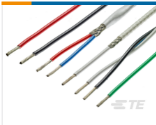
TE Part #7672673001 100G0121-0.40-9/9