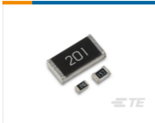
TE Part #2-2176330-7 CRGP 2010 1K5 1%