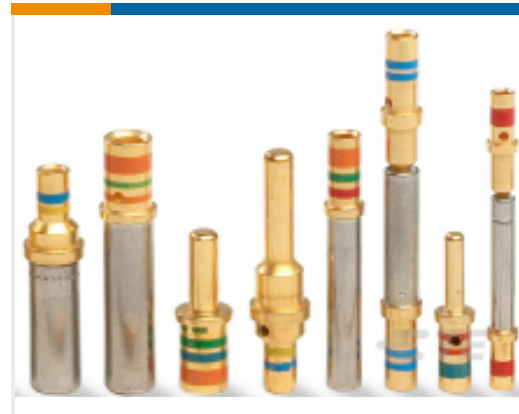
TE Part #ZPF000000000001233 097-0165-12