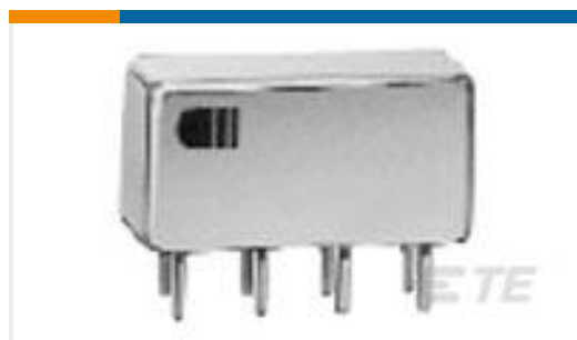
TE Part #1617037-9 HFW5A1201K00 = HFW 5AMP RELAY