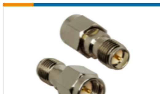
TE Part #ADP-SMAM-RPSF SMA Plug to RP-SMA Jack