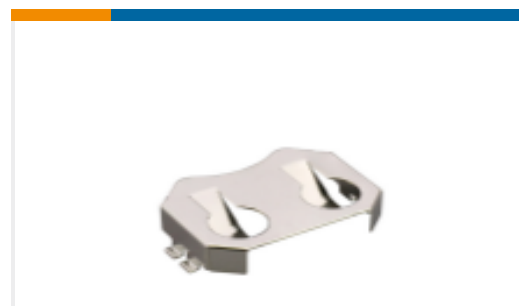
TE Part #BAT-HLD-001 Battery Holder 2032 2025 SMT Bulk Pack