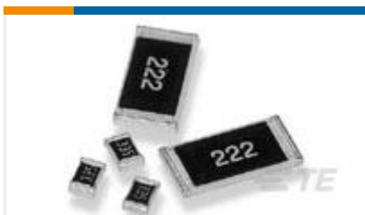
TE Part #2-1879494-5 CRGH0603 5% 10R 0.2W