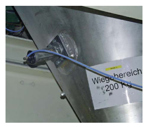
Cleaning weighing containers