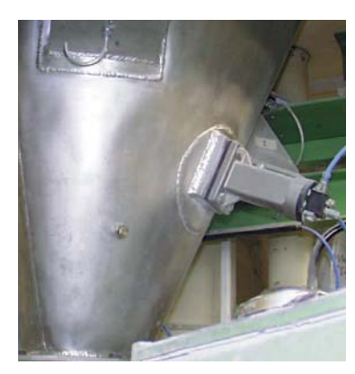
Cleaning bunker walls