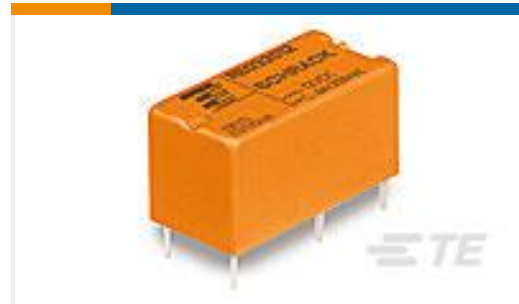
TE Part #3-1415535-7 REL34024