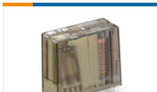
TE Part #7-1415546-8 RP824024