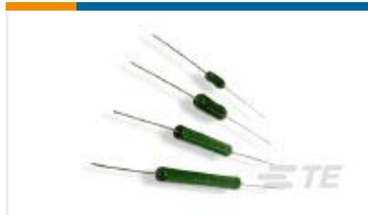
TE Part #3-1623773-0 C10 68R 5% (LOOSE)